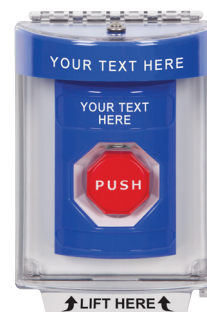
Universal Stopper® (Covers 3, 4, 7, 8)

No labeling can be placed on the Stopper Station shield.