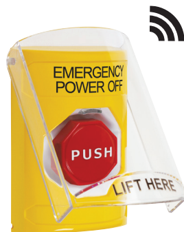
Stopper® Station Shield (Cover 2, A)

Protect your STI Stopper Station from damage or weather and help stop malicious or accidental activation.